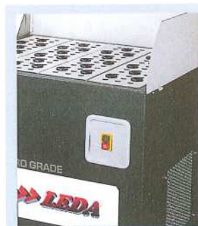
Industrial toggle and NVR switch is positioned in front for operator convenience.