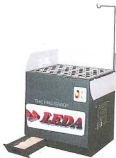
Shop vacuum or dust collector easily cleans the metal tray that is full of dust. With two outlets.