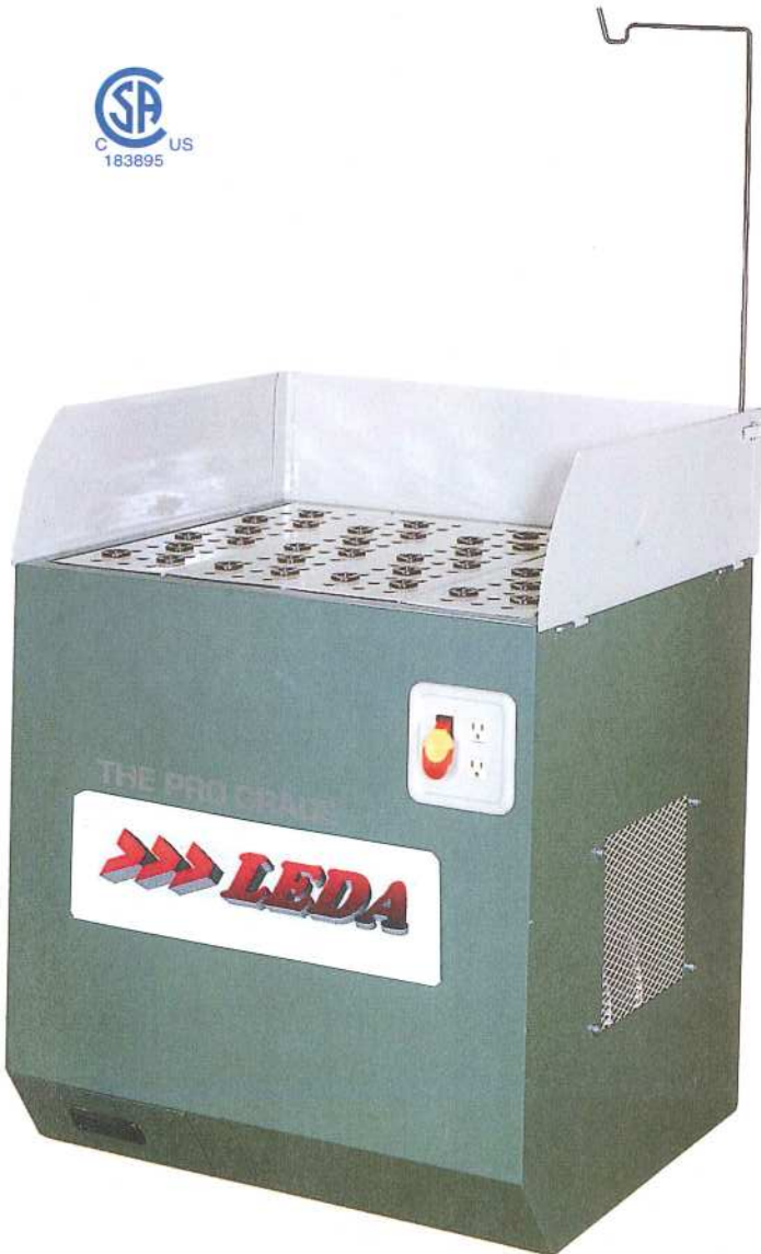
▲DT-1000 / DT-800