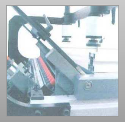
♦ Boring unit pneumatically tiltable to 45° or other angles