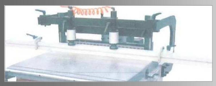
• Optional—longer guide fence for large panels