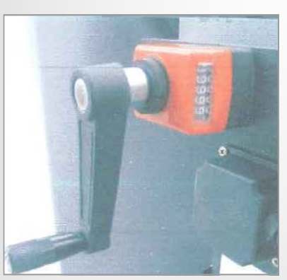
Readout for boring head adjustment